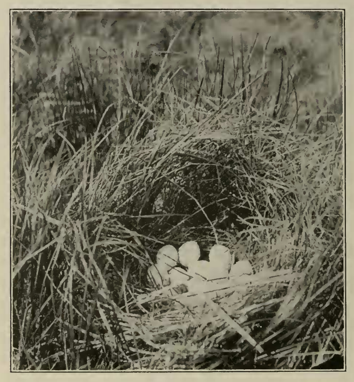
NEST AND EGGS OF KING RAIL

In the first class may be placed the following twenty-eight species which in all probability were in the country in greater or less numbers previous to its settlement: Pied-billed Grebe, Black Tern, Mallard, Blue-winged Teal, Bittern, Least Bit-